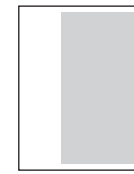
2/3 Vertical 9.75w x 4.9375h